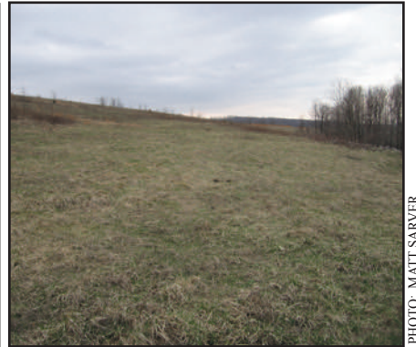
Clockwise from top left : Crop residue, bare or tilled soils, cool season grass pastures, and old fields all require different techniques.