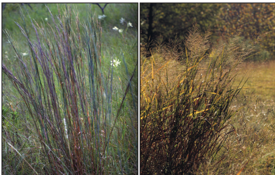
Warm-season grasses are critical to a successful meadow. For bee meadows, the smaller species like little bluestem (left) should be favored over large and aggressive species like switchgrass (right).

Virginia Wild Rye ( Elymus virginicus ) is similar to the previous species, but adapted to wet areas, floodplains, and stream banks.