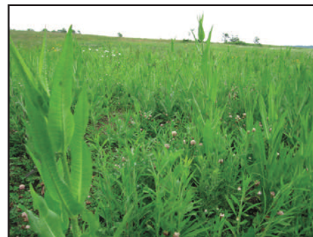
Incomplete weed control prior to planting can cause problems later.

7. Cultipack or roll the soil before seeding if using a drill, or after seeding if broadcasting.